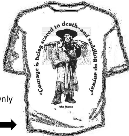
Illustration Only ← Front Back →

Pre-Order Camporee T-Shirts are $10 each ($12 for XXL) After Sept 30, 2011, T-Shirts are $12/$14 each and must be picked up at the Scout Office about 2 weeks after the event. Shirts are Natural Color.